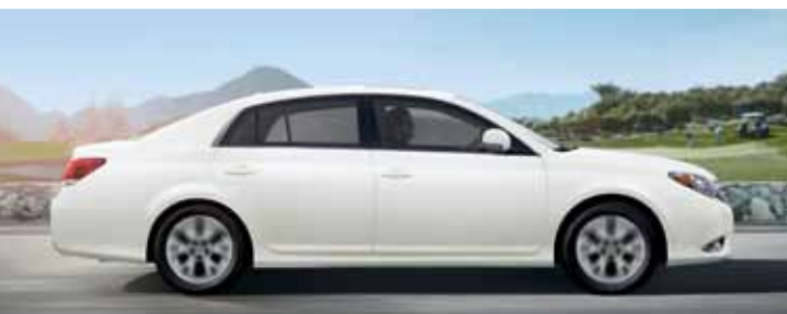
XLS shown in Blizzard Pearl.