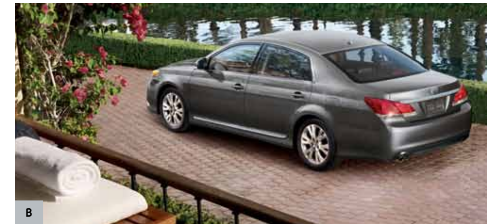
FRONT COVER XLS shown in Black.

A simple drive turns into a pleasurable cruise with the 2011 Avalon. With state-of-the-art luxury, an exceptionally spacious interior and a host of technological innovations, you'll savour every moment. Backed by a powerful V6 engine, the Avalon XLS braves the elements with style and grace. Crafting the perfect balance between refinement and performance – that's how we make things better with the 2011 Avalon.